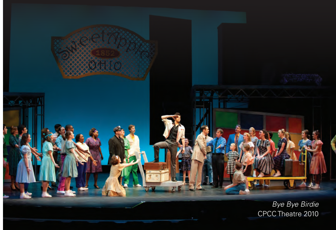
Bye Bye Birdie CPCC Theatre 2010

*All contributions are tax deductible and will help keep the great tradition of CPCC Theatre, Summer Theatre and Opera Theatre alive for years to come!