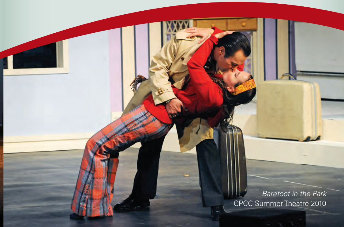
Barefoot in the Park CPCC Summer Theatre 2010