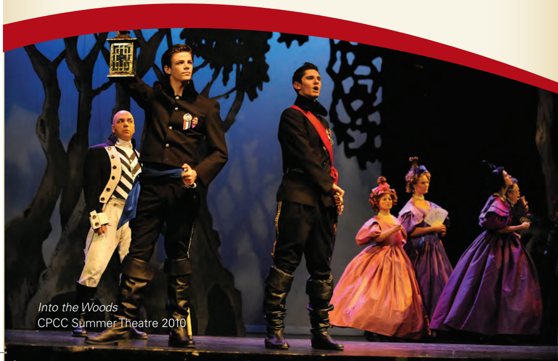
Into the Woods CPCC Summer Theatre 2010

CPCC Opera Theatre and Summer Theatre show titles subject to availability.