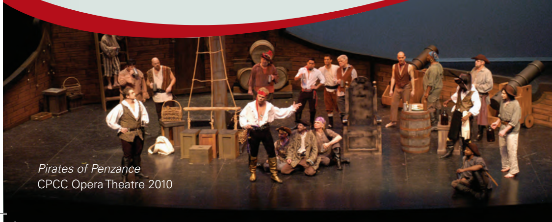
Pirates of Penzance CPCC Opera Theatre 2010